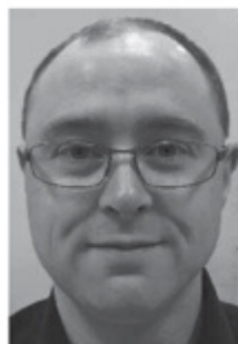
BRANDON FIREARMS SPECIALIST