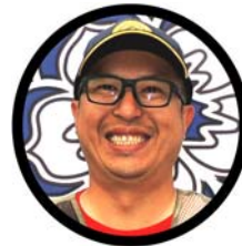
DOUBLES MARSHALL WIRAWAN 95 / 100